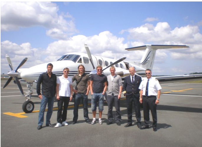
As commercial pilot you may fly with interesting passengers. Here we are with 5 players from the national Danish football team.

If you have further questions, please do not hesitate to contact us.