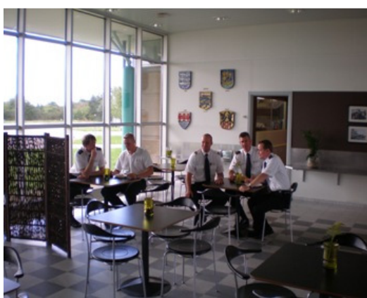
Accommodation at the airbase and eating in Café Airport in Airport Vojens.

Vojens Airport is the civilian part of Skrydstrup Air Base, the home base of the Royal Danish Air Force F16s. You will find our study facilities modern, nice and friendly.