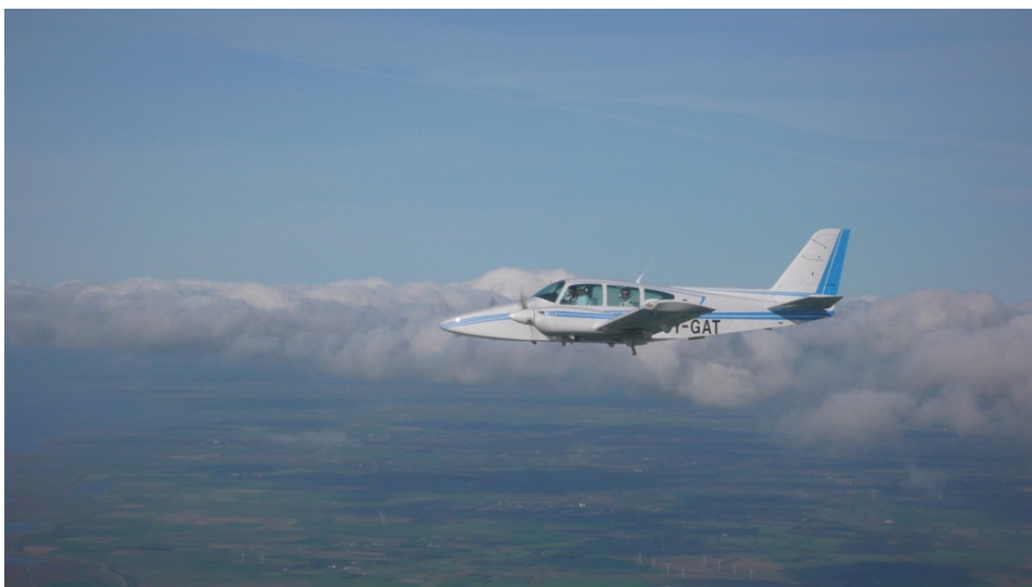
Two student pilots and a flight instructor flying MEIR in OY GAT

Accommodation on the air base can be offered at a price of DKK 50.000 or €6.666 for 20 months.