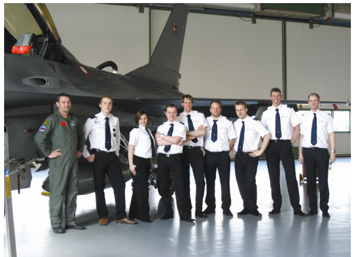
Student pilots with the F-16 pilot who taught Principles of Flight. The class also tried the F-16 simulator